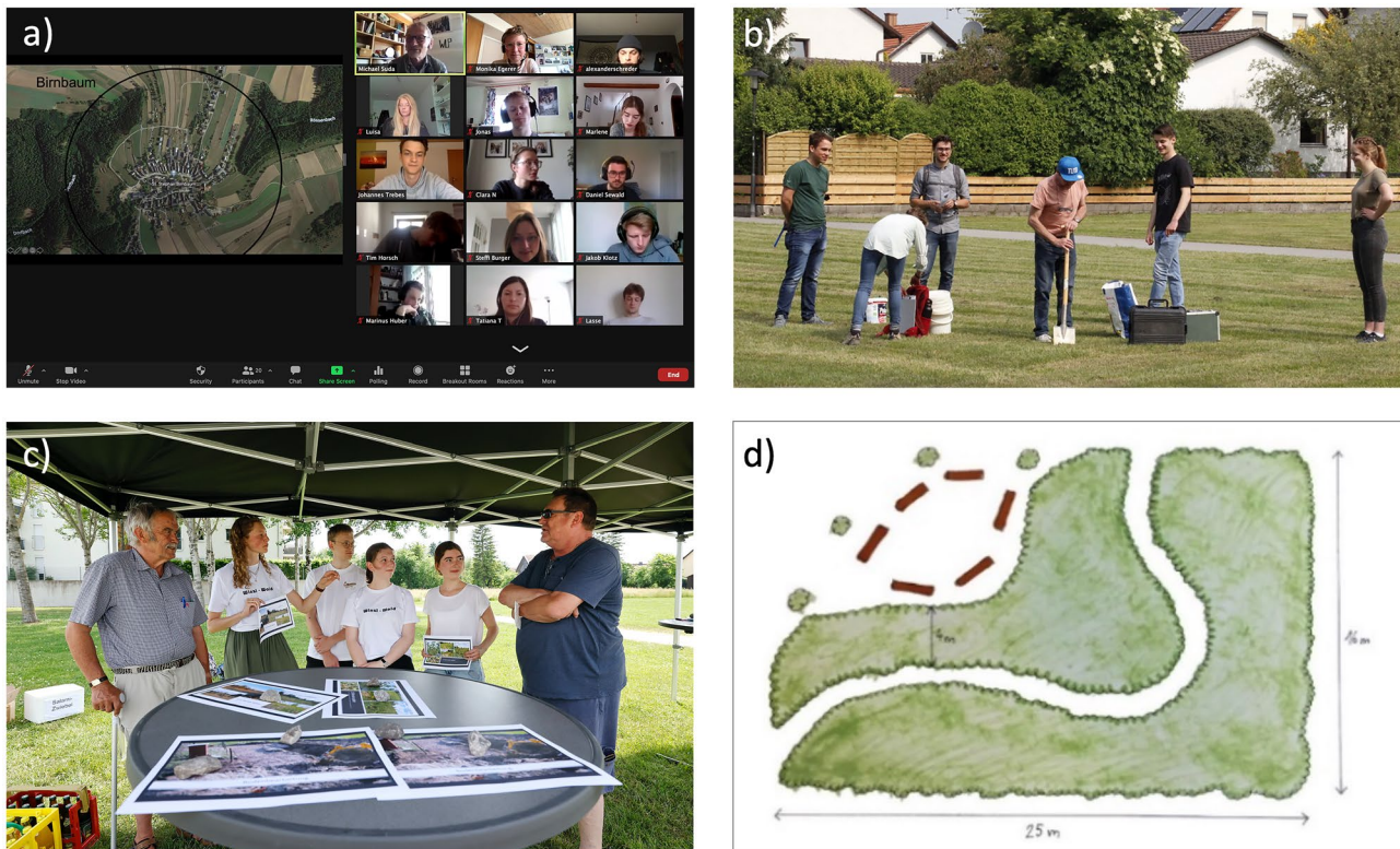
Fig. 1 Snapshots of the teaching experience: a) first digital exercise in which students presented the greenspaces and nearby nature in their hometowns; b) sampling soils in the proposed sites in Hallbergmoos; c) community participation in “World Café” round table

discussions documented by the local newspaper; d) one example of a proposed design of the overall structure of a Tiny Forest illustrated by the students.